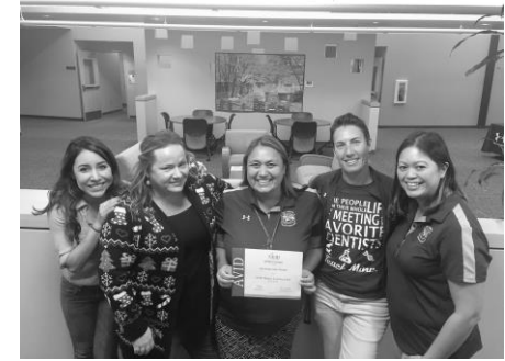
DNHS AVID team receiving AVID's Highly Certified Site Distinction