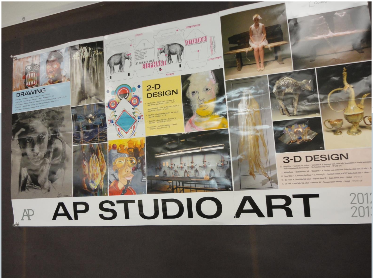
2013/14 AP Studio art poster published by the College Board to show examples of the highest scored work