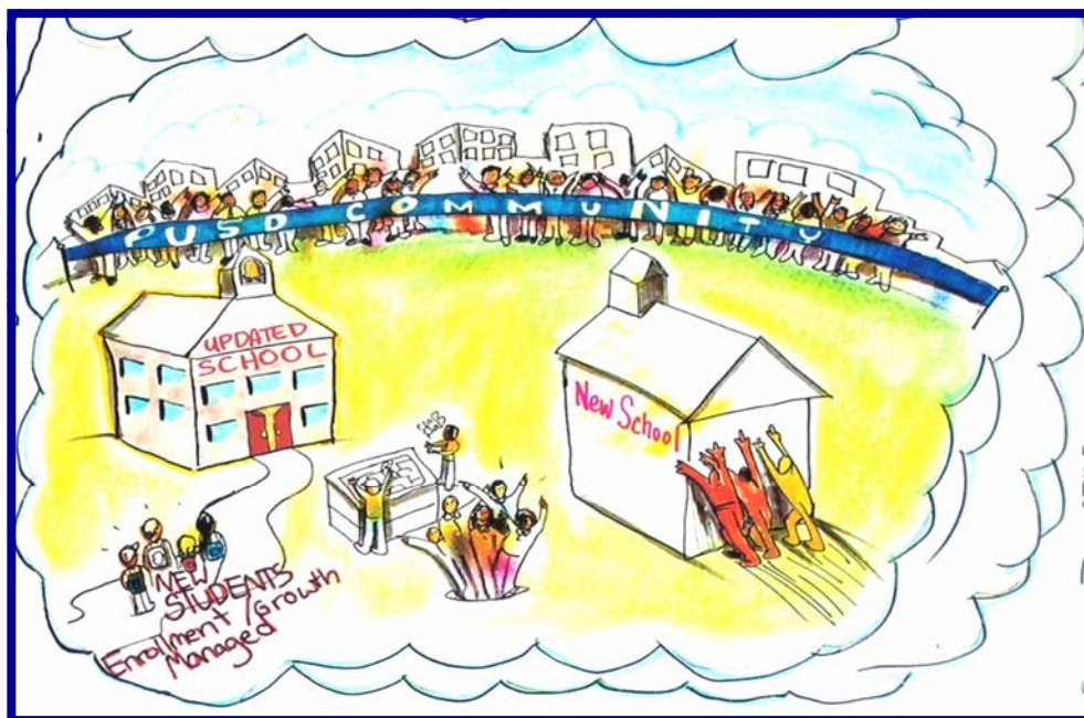
Portion of mural drawn during 2002 Strategic Planning sessions depicting the district Goal of Facilities.