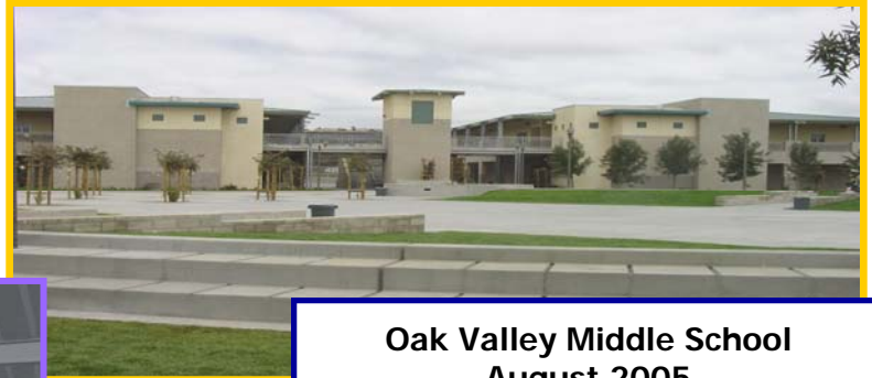
Oak Valley Middle School August 2005