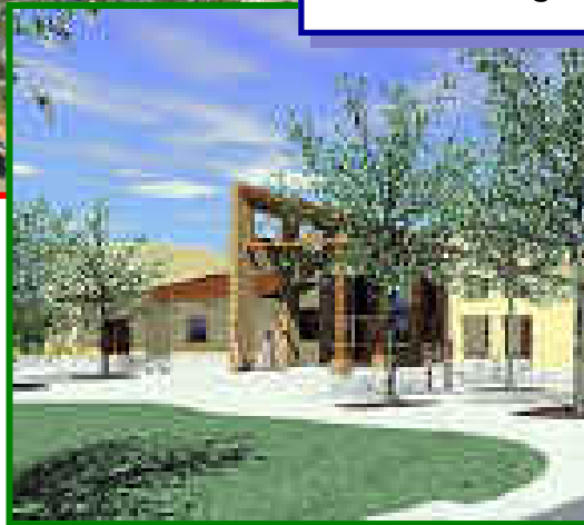
Monterey Ridge Elementary School Scheduled Opening August 2006