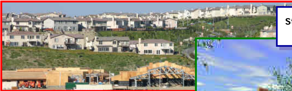
Stone Ranch Elementary School August 2004