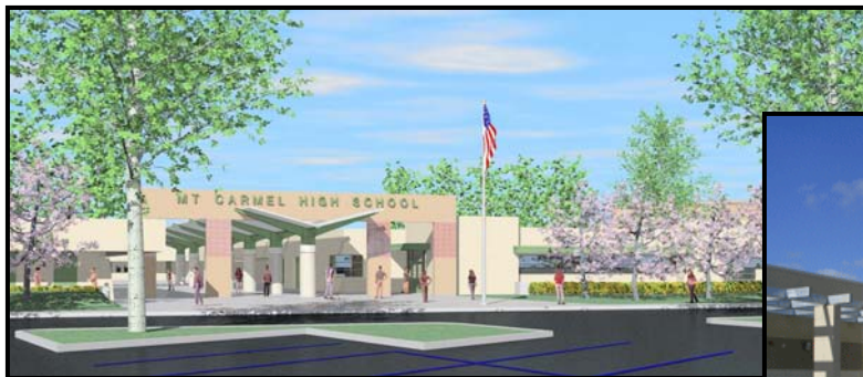
Mt. Carmel High School