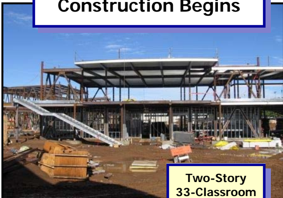
Two-Story 33-Classroom Building