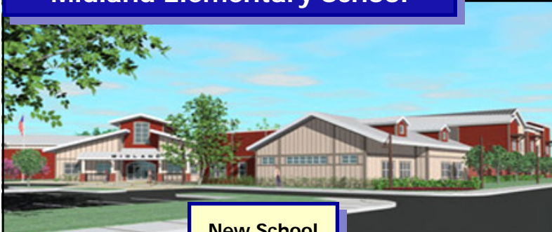
New School Dedication Ceremony